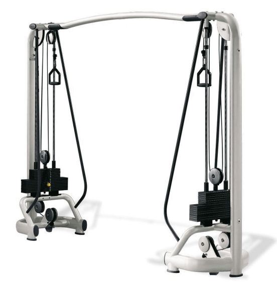
Selection Cable Cross